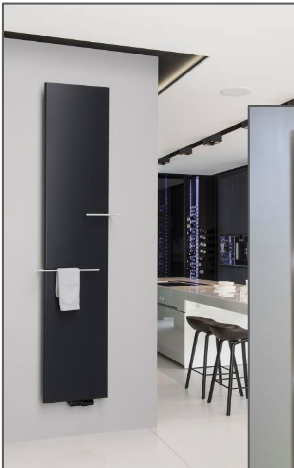
Oni (below) and Niva (left) both radiators shown with a colour coordinated centre connection

Introducing the range of elegant and sophisticated black designer radiators from Vasco, the market leader in Belgium and now available in the UK. The trend for monochrome has ignited the imagination and these radiators are now becoming a statement item. The contrast between a lighter background and dark-through-to-black furniture, fabrics and other essential elements can be introduced into living rooms, kitchens and bathrooms, creating an ambience unique to each setting.