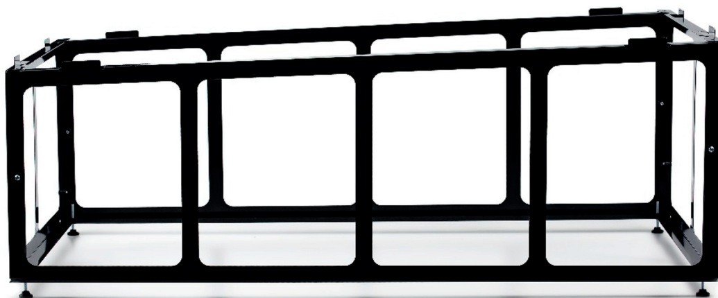
11VE46002 Mounting support DX (E) horizontal