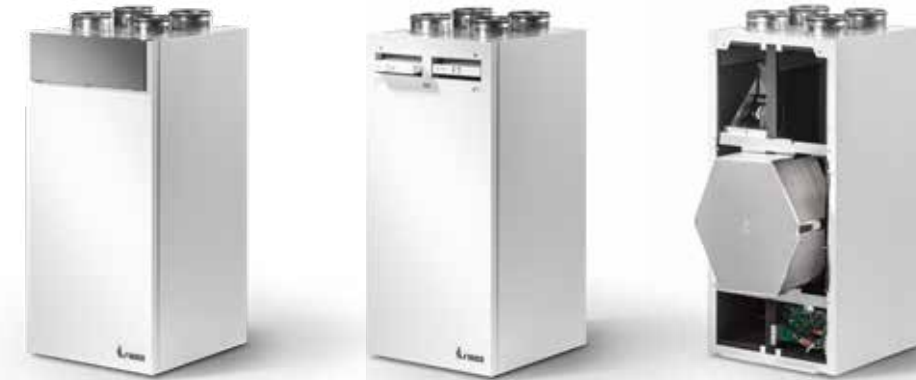
UNIT D150EP II