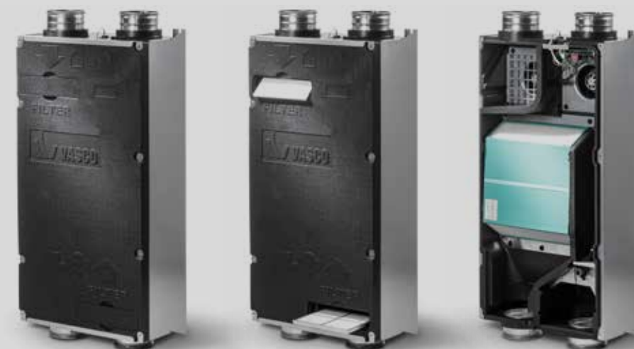
UNIT D275 III / D275EP III

FOR COMPACT HOUSING VERTICAL + HORIZONTAL INSTALLATION