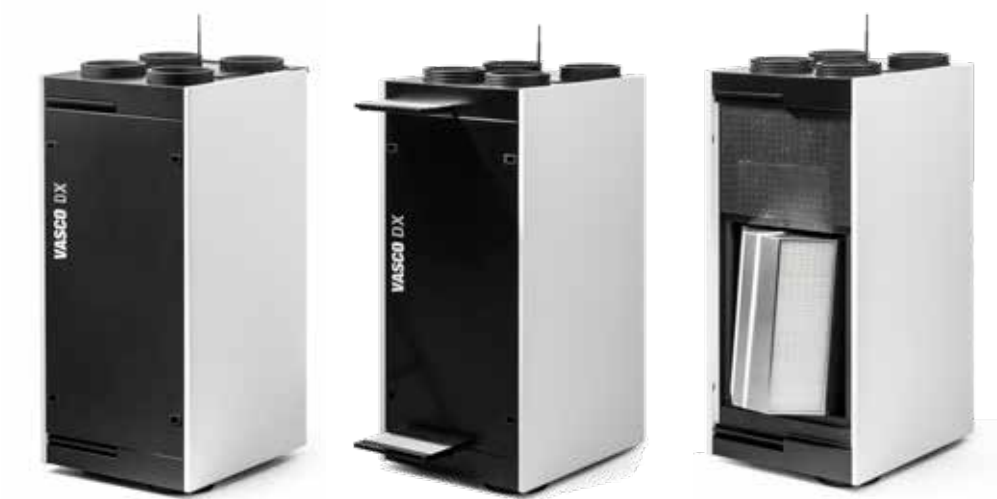
UNIT DX4 / DX5 / DX6 (vertical & horizontal)