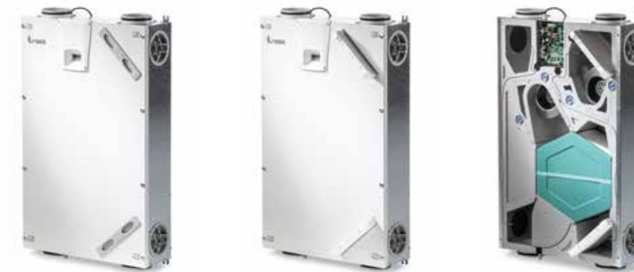
UNIT D150 COMPACT

Discover Vasco's range of radiators, ventilation, underfloor heating and cooling. www.vasco.eu