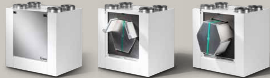
UNIT T350/T500 | UNIT X350/X500 | UNIT D350/D425

SILENT OPERATION HIGH EFFICIENCY OPTIMAL COMFORT